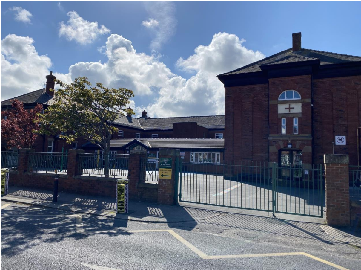
St John Vianney Catholic Primary School _ Meet the Teacher - 2W